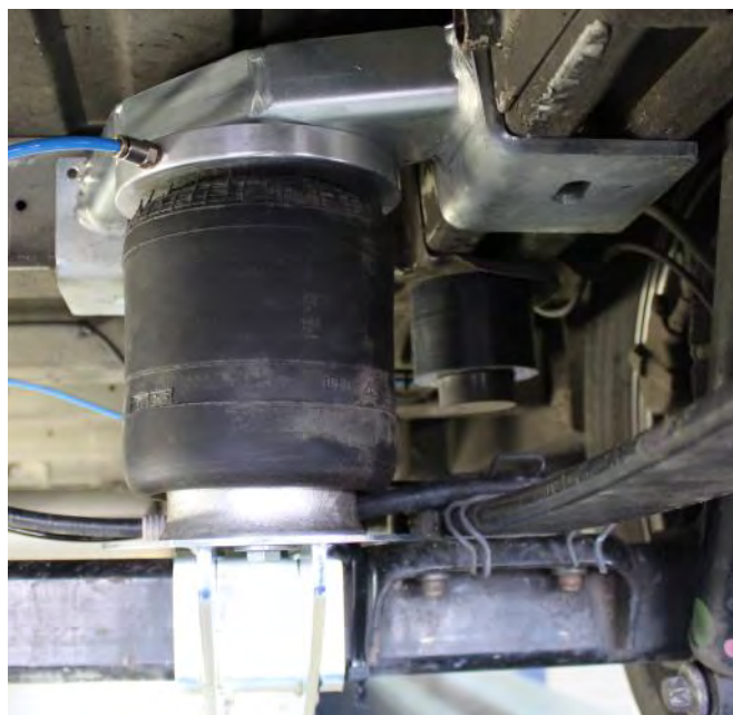
NR-137904 Air Master Ultra

75% of the comfort of a full air suspension for less than half the price !