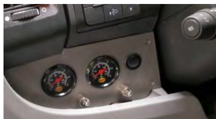
Car specific control panel CS Set Air Master Ultra